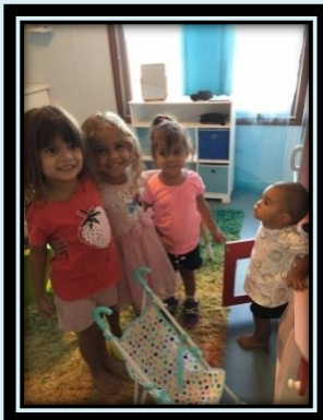
Playing and learning together forming friendships.

Throughout the term the learning program will continue to focus on the child but will also include the wider community i.e. community workers