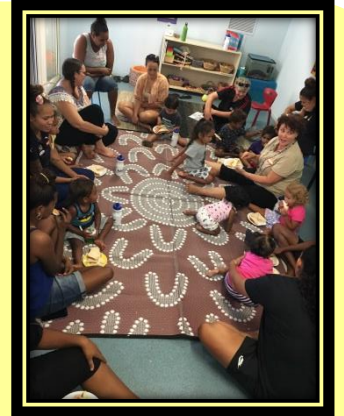
Morning Tea at Playgroup

Each day before morning tea the children participate in a singing rhyme that is designed to be fun and remind everyone of the importance of washing hands before eating. Before the families share morning tea the children sing favourite and well known songs and rhymes.